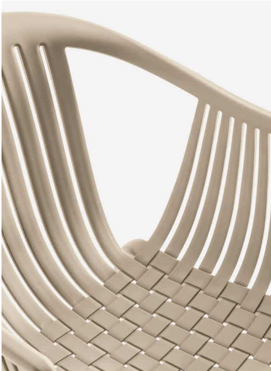
Side chair Sedia