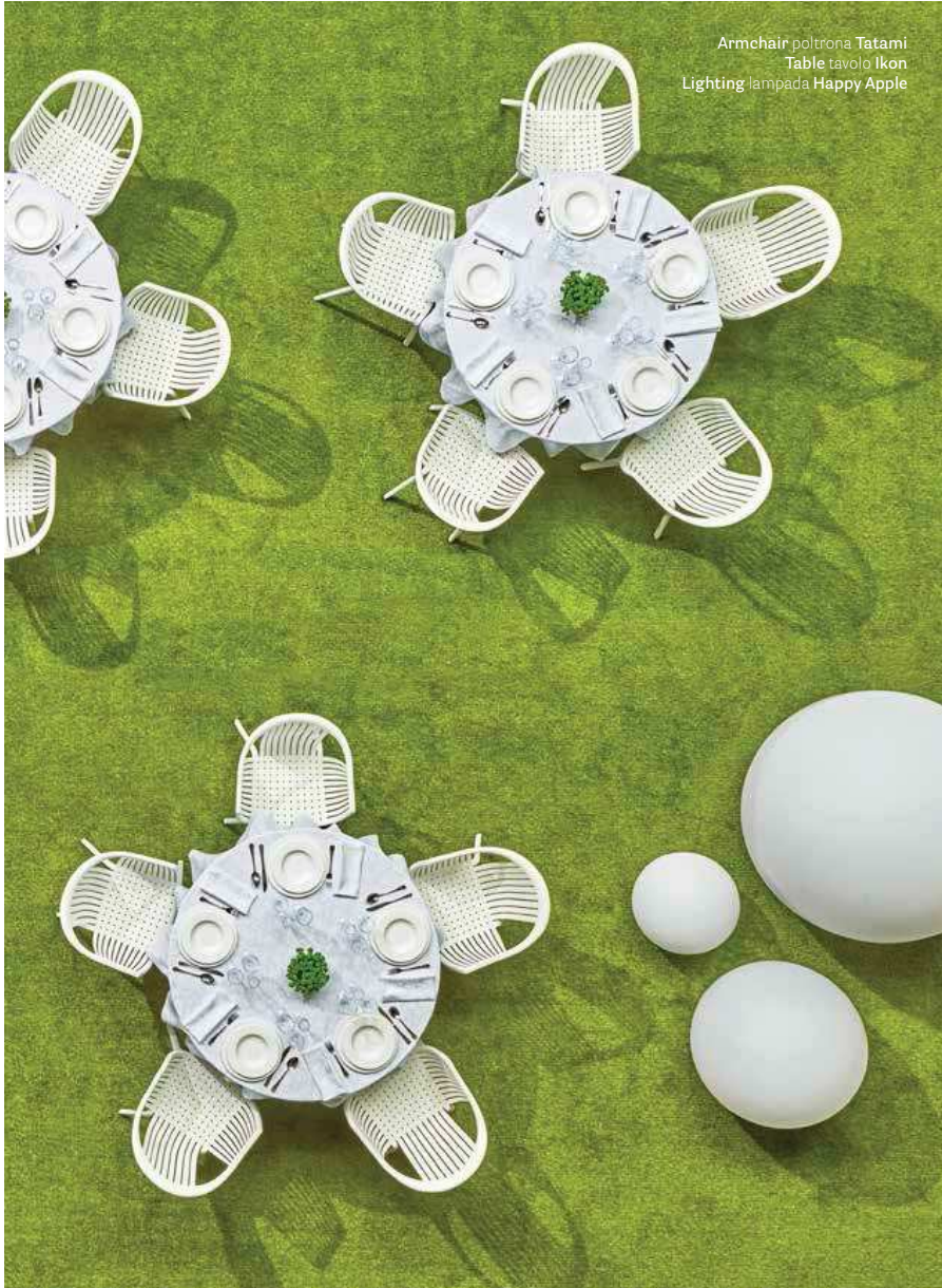
Armchair poltrona Tatami Table tavolo Ikon Lighting lampada Happy Apple