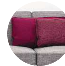
DSO2.3 Cushion only