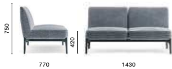
DSO2_2L 2 linear seats sofa