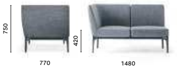
DSO2_2AL 1 corner + 1 linear seat sofa