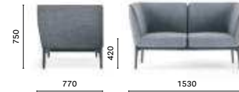
DSO2_2A 2 corners sofa