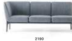
DSO2_3ALL 1 corner + 2 linear seats sofa