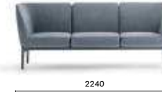
DSO2_3AAL 2 corners + 1 linear seat sofa