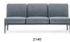
DSO2_3L 3 linear seats sofa