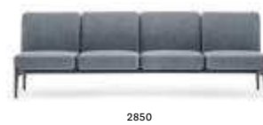
DSO2_4L 4 linear seats sofa