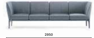
DSO2_4AALL 2 corners + 2 linear seats sofa