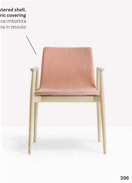
Upholstered shell, fabric covering Scocca imbottita rivestita in tessuto