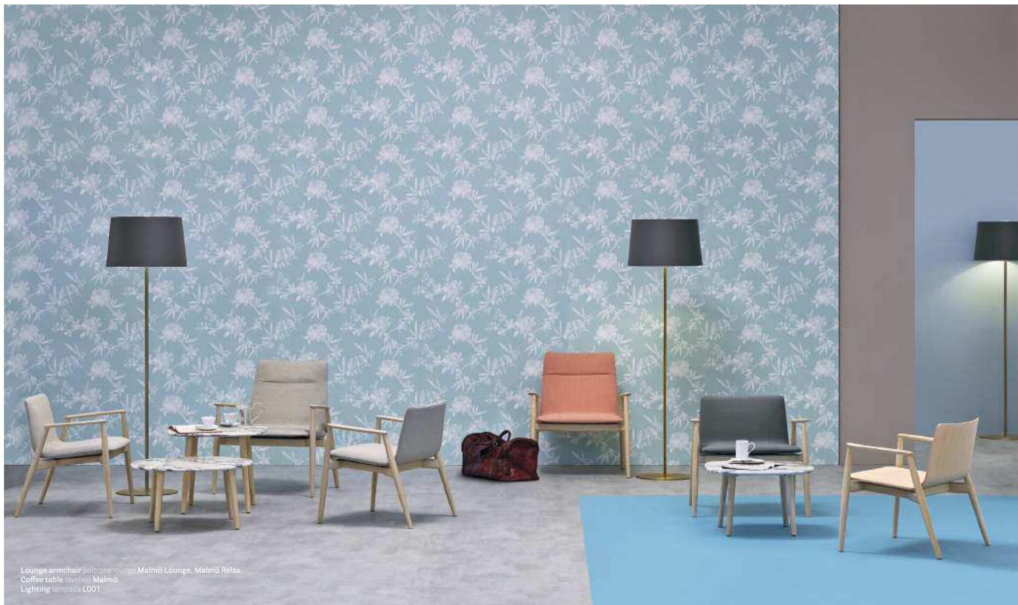
Lounge armchair poltrona lounge Malmö Lounge, Malmö Relax. Coffee table tavolino Malmö. Lighting lampada L001