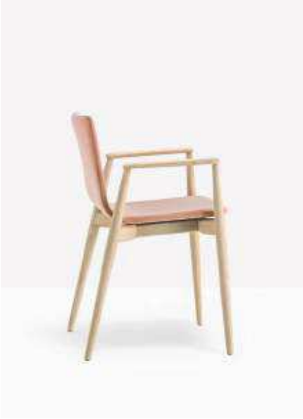
ARMCHAIR / POLTRONA