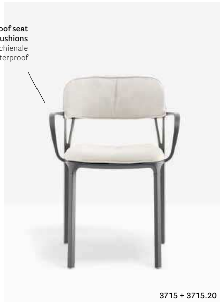
Waterproof seat and back cushions Cuscino per sedile e schienale in tessuto waterproof