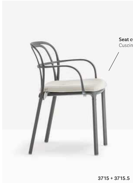
Seat cushion only Cuscino per solo sedile