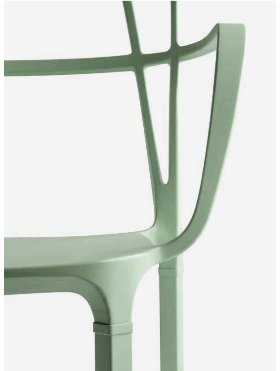
ARMCHAIR / POLTRONA