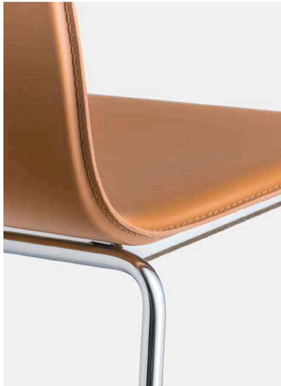
SIDE CHAIR / SEDIA