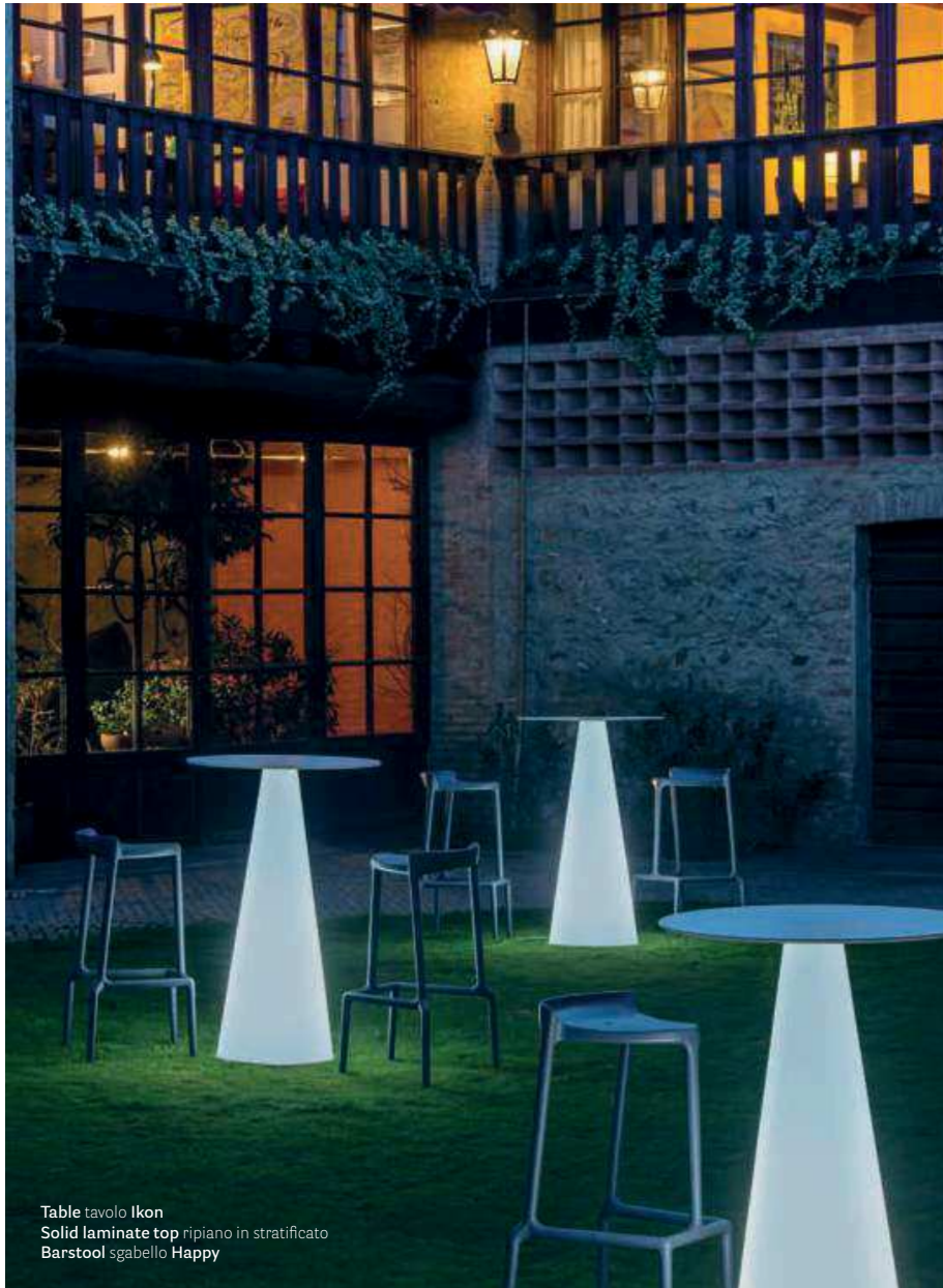
Table tavolo Ikon Solid laminate top ripiano in stratificato Barstool sgabello Happy