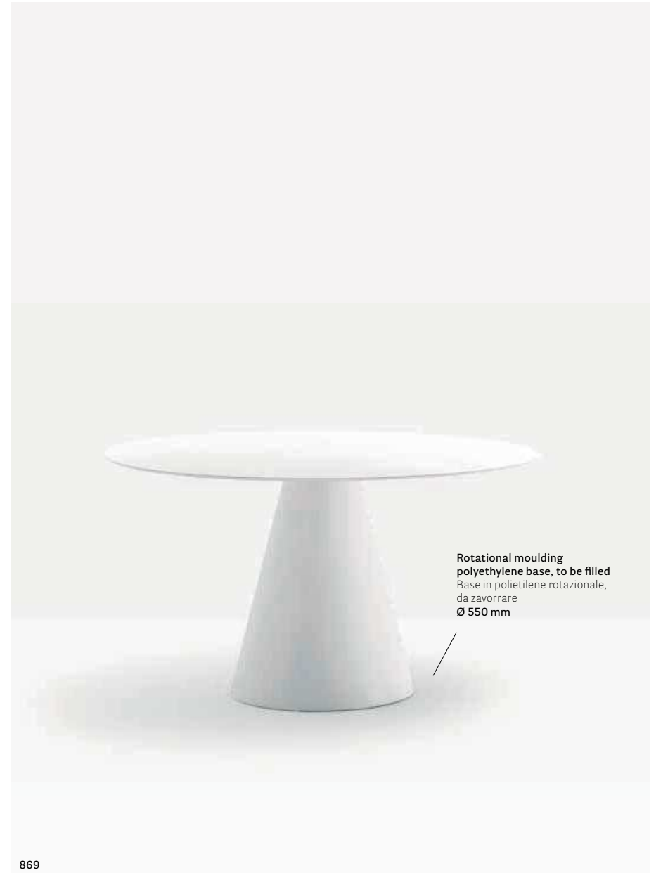
TABLE / TAVOLO

Rotational moulding polyethylene base, to be filled Base in polietilene rotazionale, da zavorrare Ø 550 mm