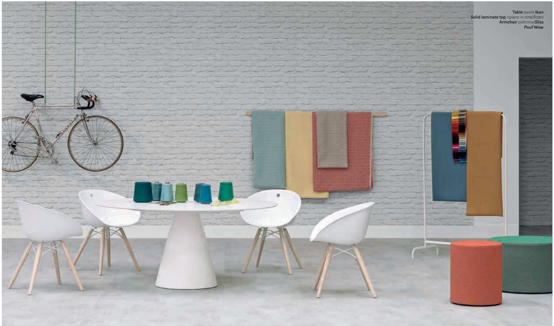
Table tavolo Ikon Solid laminate top ripiano in stratificato Armchair poltrona Gliss Pouf Wow