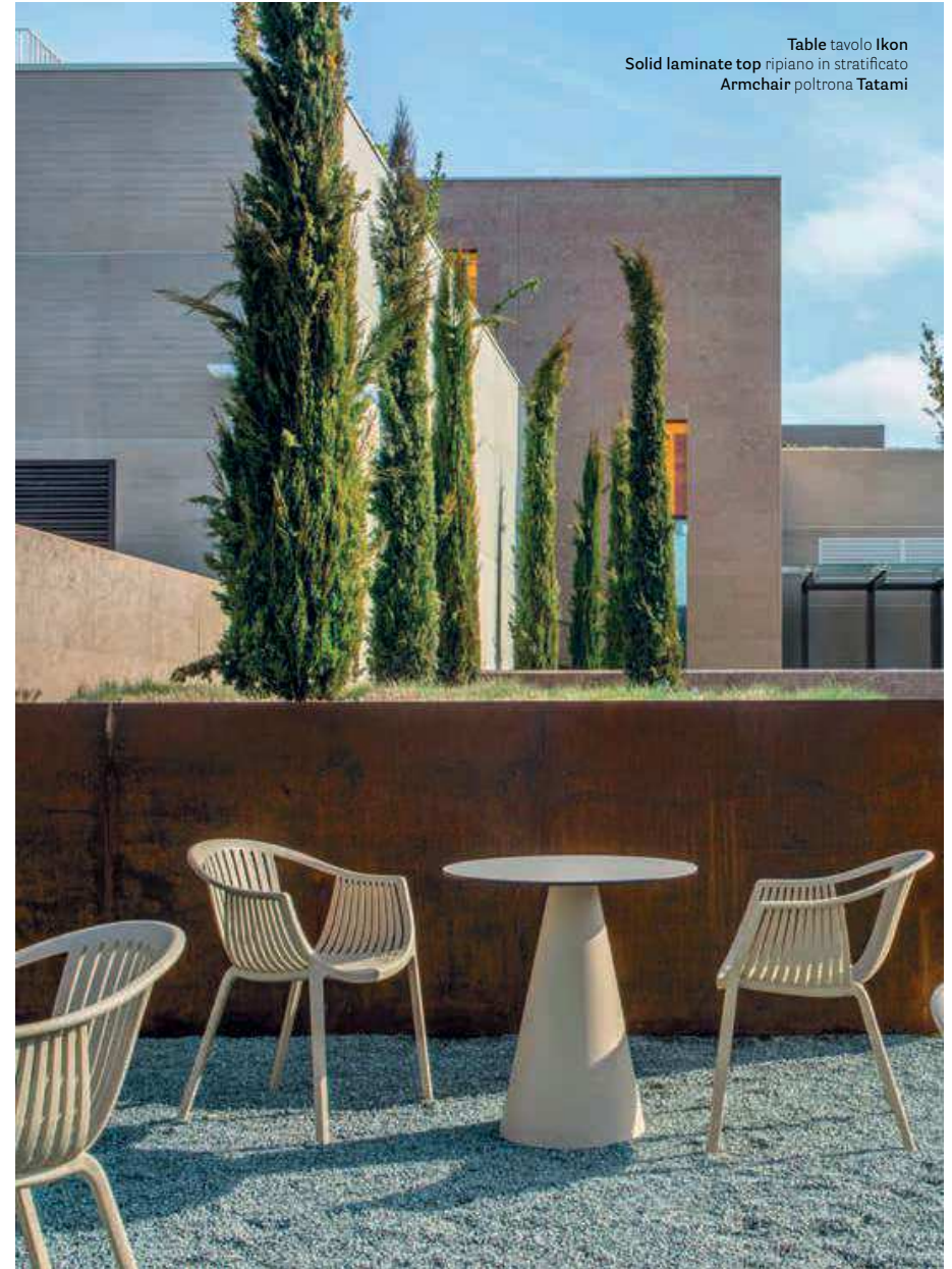
Table tavolo Ikon Solid laminate top ripiano in stratificato Armchair poltrona Tatami