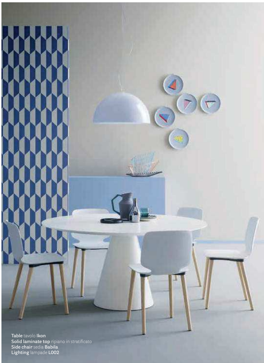
Table tavolo Ikon Solid laminate top ripiano in stratificato Side chair sedia Babila Lighting lampade L002