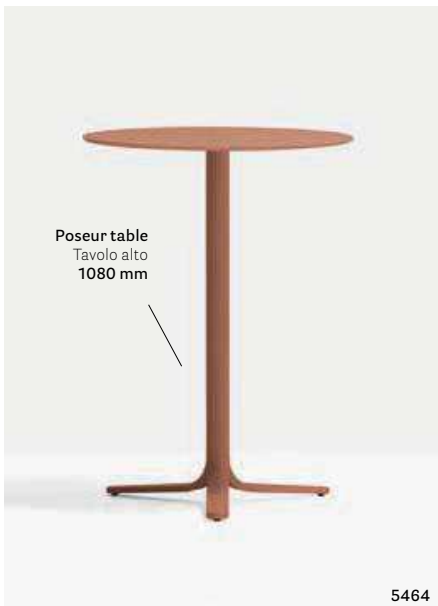
TABLE / TAVOLO