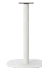
PONGO BASE H74 □ 74 □ 45 □ 45 ⌘ 1 m³ 0,20