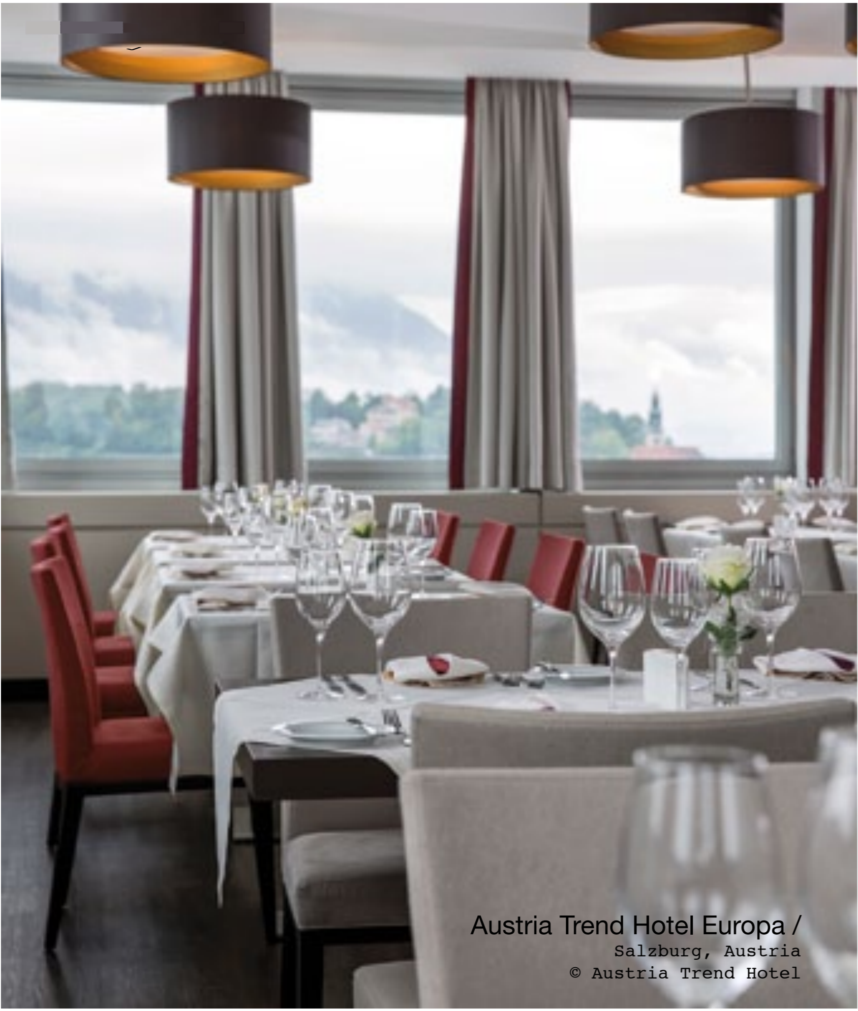
Austria Trend Hotel Europa / Salzburg, Austria