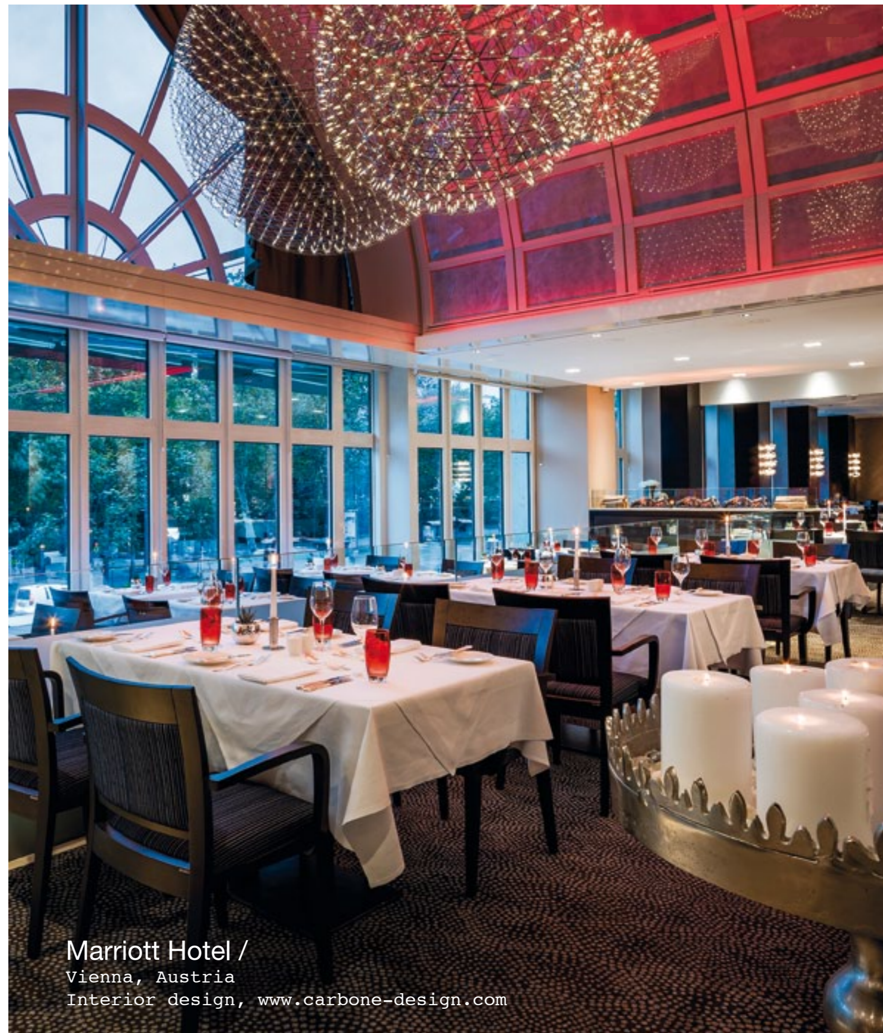
Marriott Hotel / Vienna, Austria Interior design, www.carbone-design.com