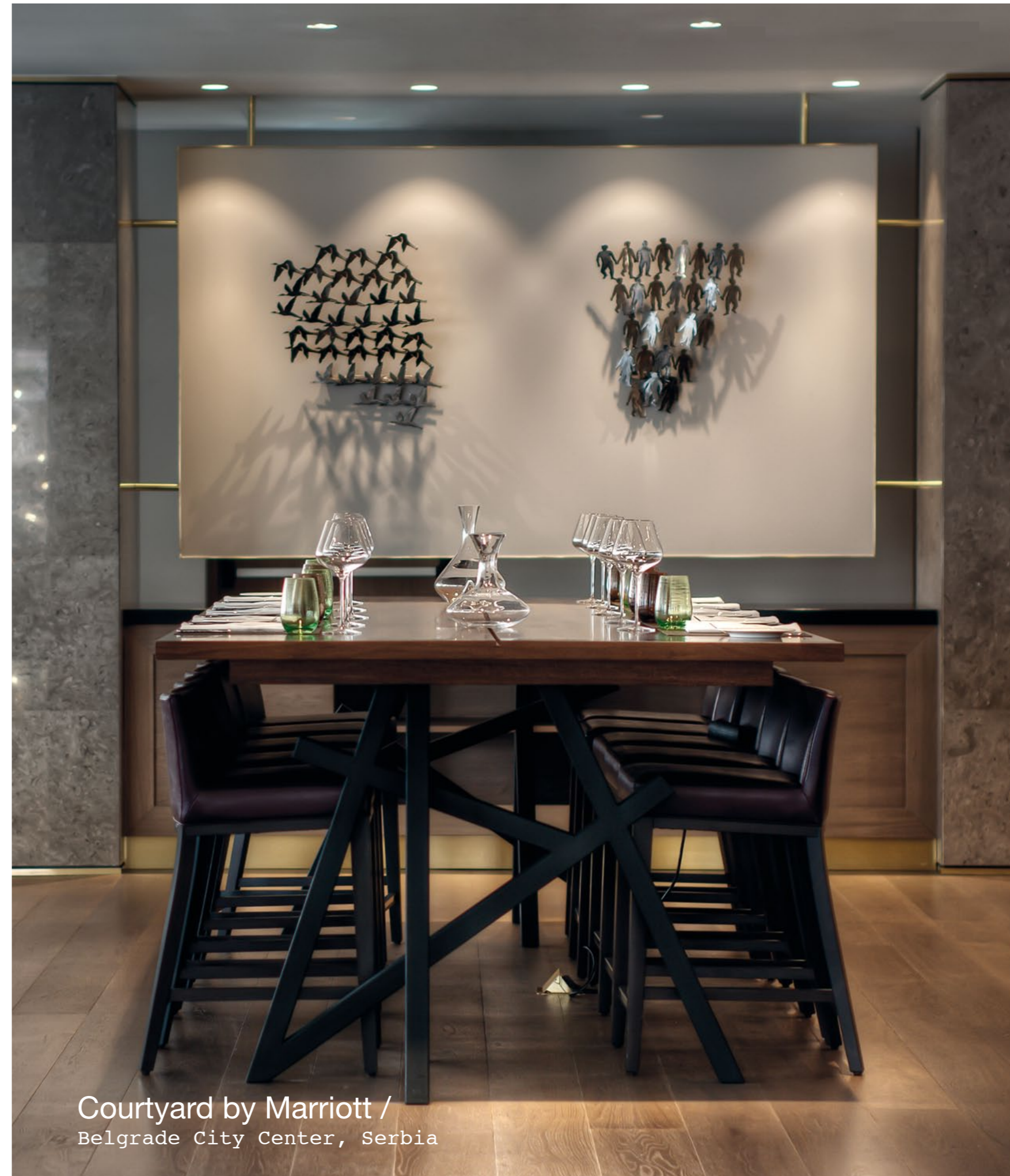
Courtyard by Marriott / Belgrade City Center, Serbia