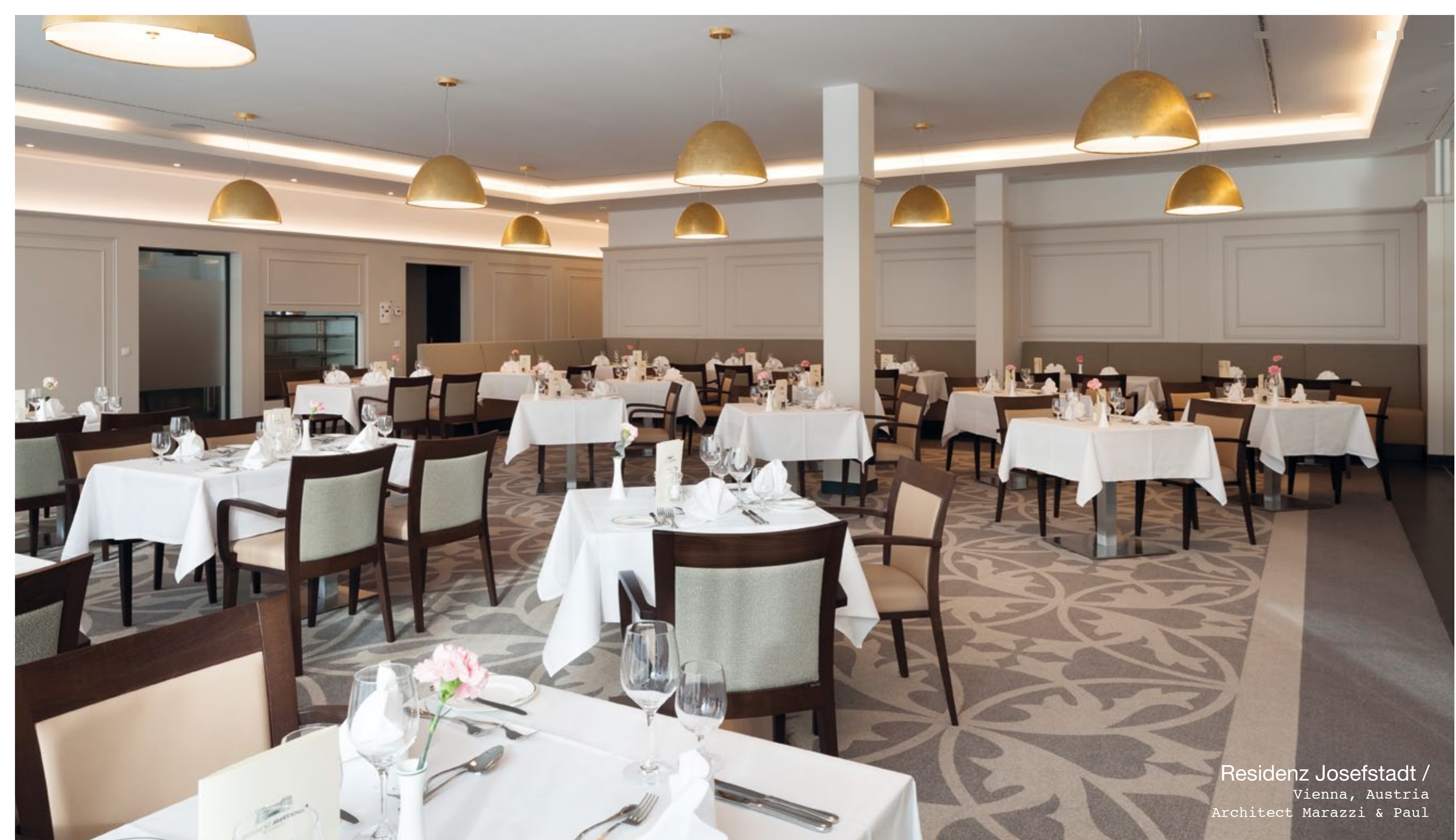
Residenz Josefstadt / Vienna, Austria Architect Marazzi & Paul