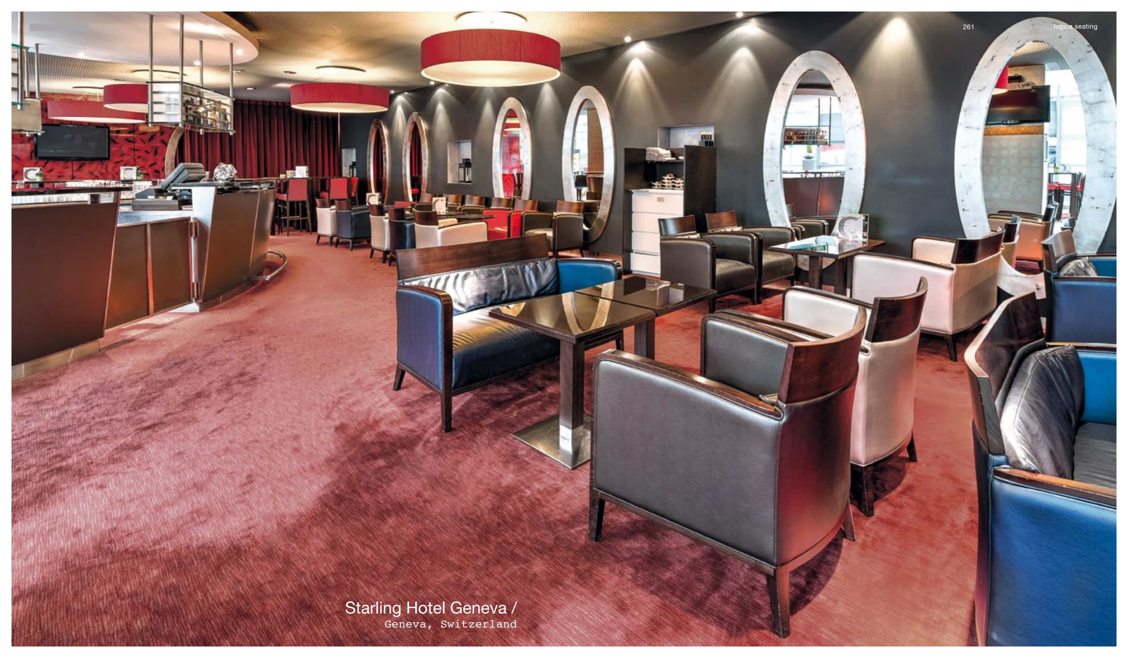
Starling Hotel Geneva / Geneva, Switzerland