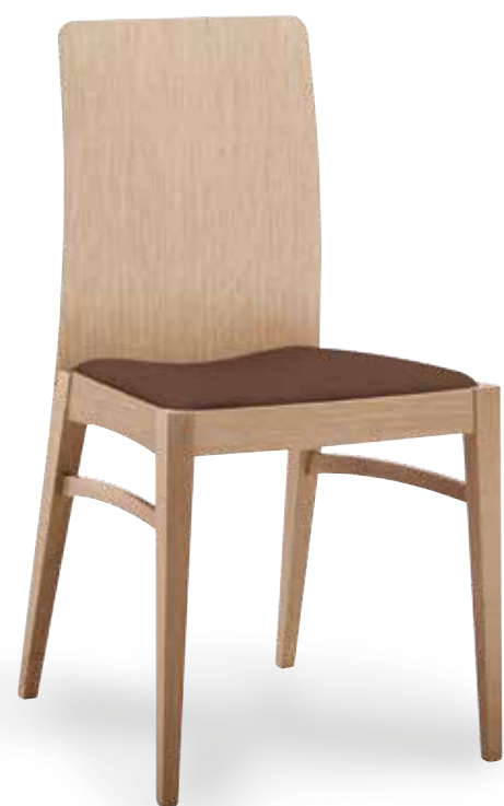
150 SE faggio-rovere