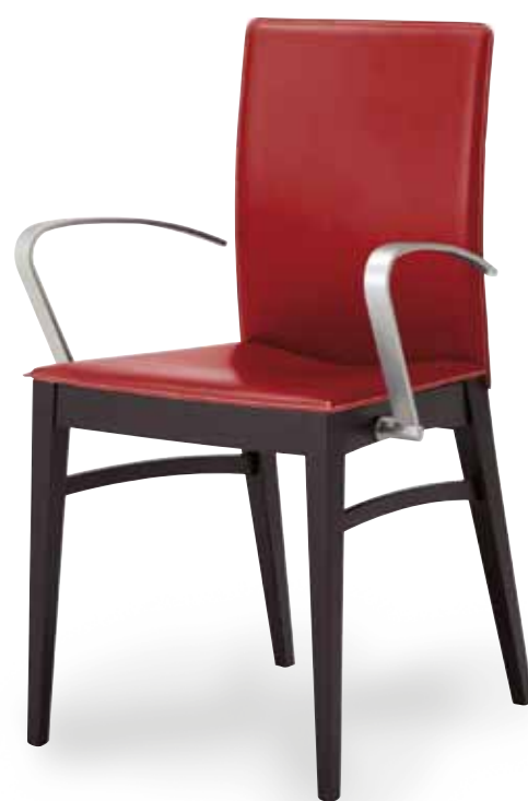
150 PO faggio-rovere